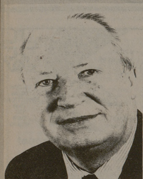
EDWARD HEATH Prime Minister of Great Britain 1970-74