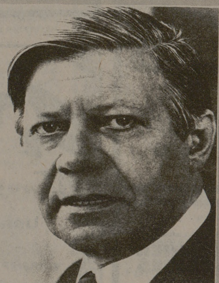
HELMUT SCHMIDT Federal Chancellor of West Germany 1974-82