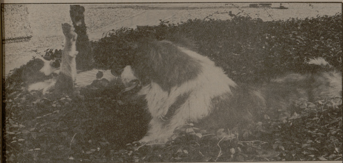
Roll over, Rover