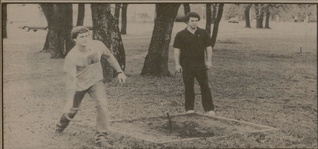
Come "horse" around with us! Enter the Intramural Horseshoe doubles tournament.