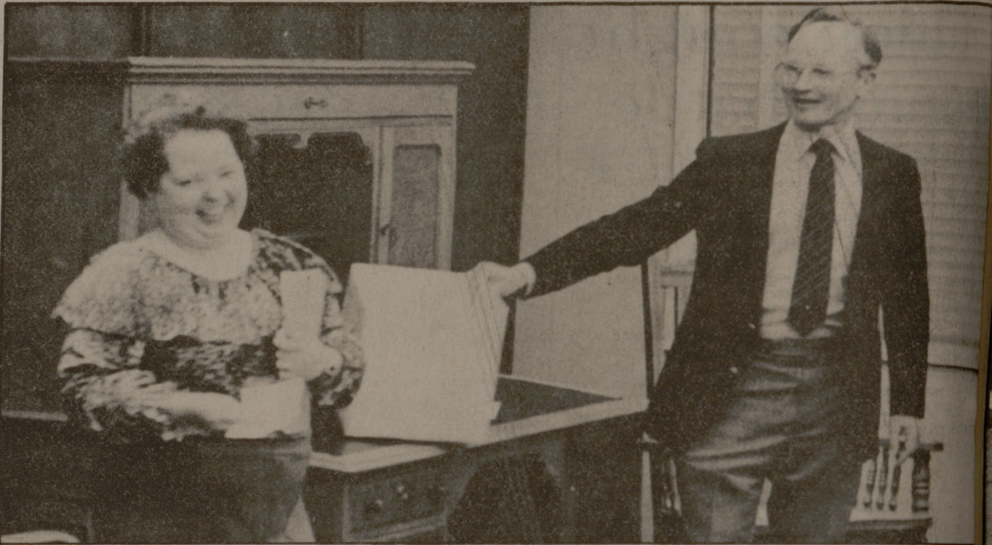
And the winner is...

Brown's office attributed the big increase to "greater efficiency in capturing the data" and improved accuracy in reporting.