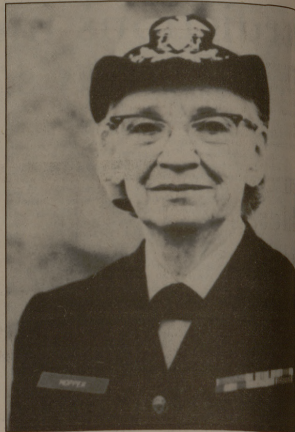
Capt. Grace Hopper