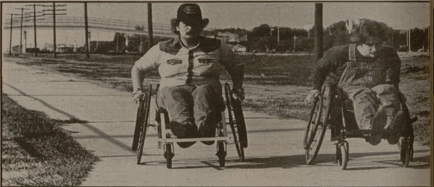
I'll race ya'