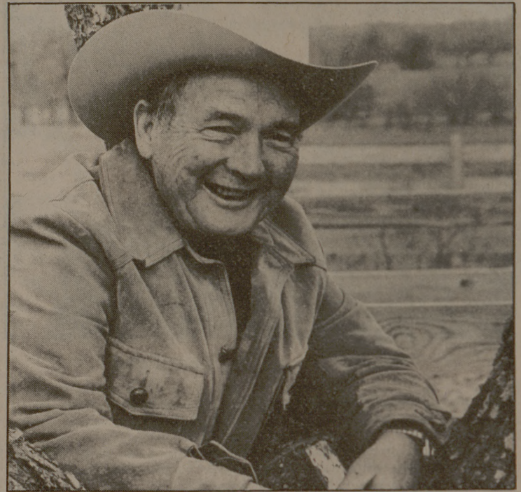
Candidate John Henry Faulk

However, Faulk said he is a legitimate candidate and he will