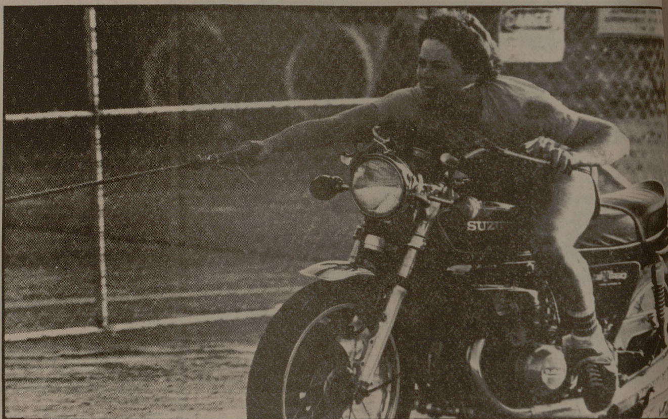
Towing the line

Next year's tournament will be held at Texas Tech University in Lubbock.