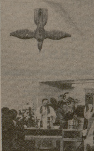
Stan Sultemeier 693-4403

1100 F.M. 2818 1st Pro Grand College Station, Texas