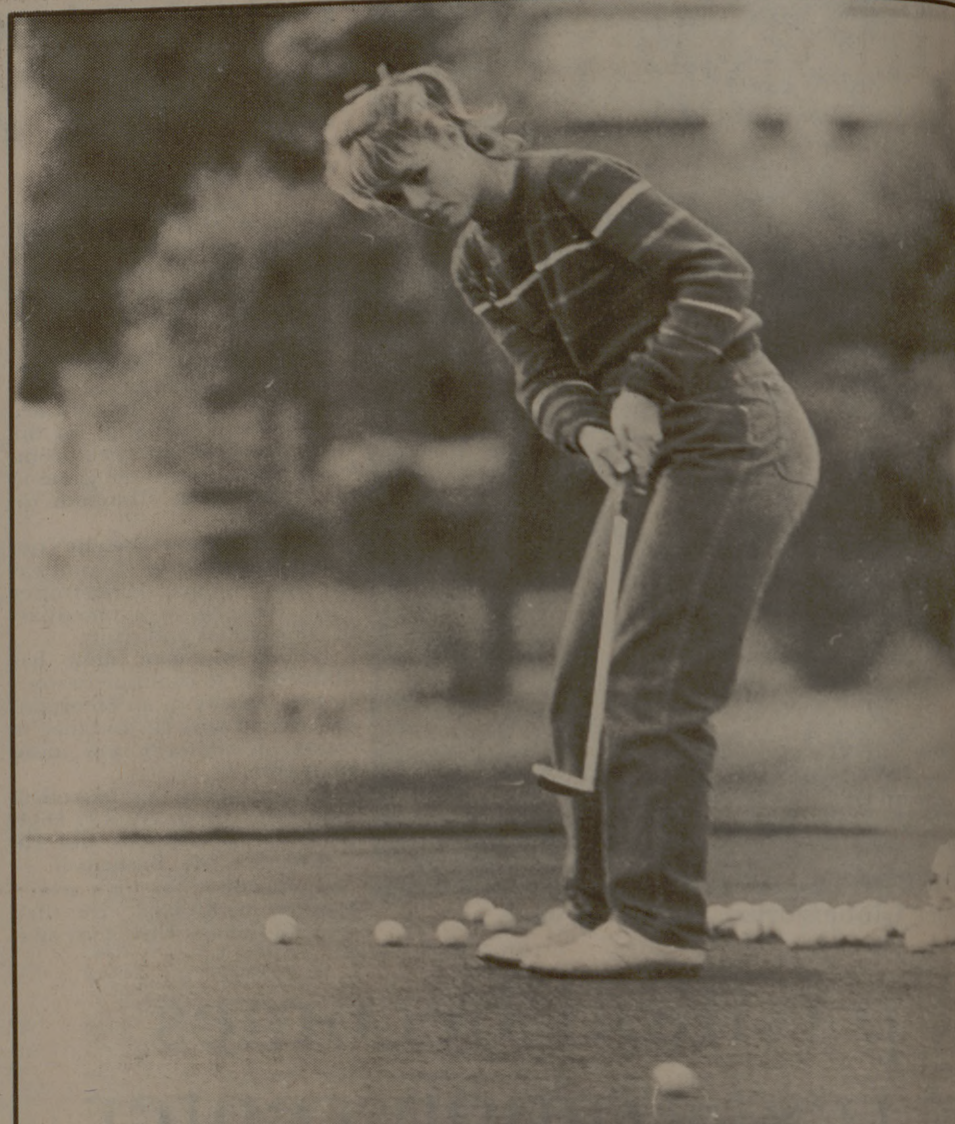
Keeping an eye on it

212 N. Main AND Culpepper Plaza Downtown Bryan College Station 822-5119 693-0677 MC VISA DINNERS CLUB AM EXPRESS LAYAWAYS INVITED