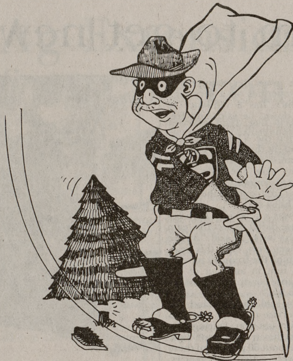
Saberman The Aggie's 13th Man