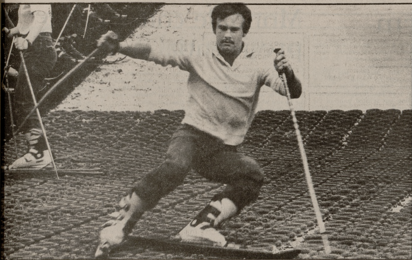
Ready for the real thing