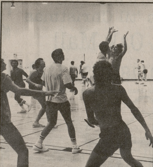
Get your basketball team together, get your entry into the IM-REC Sports Office and start participating!!!

Thanks to all the Pickleball pants and let's all spread the word about Pickleball!!!!