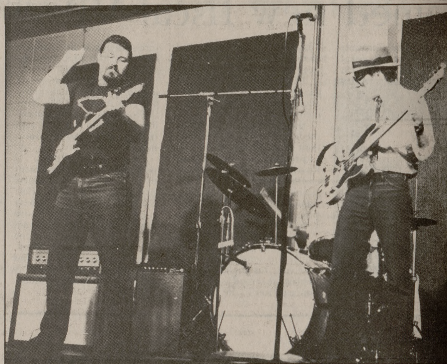
Omar and the Howlers

The material was there and they had the talent — it just wasn't employed.