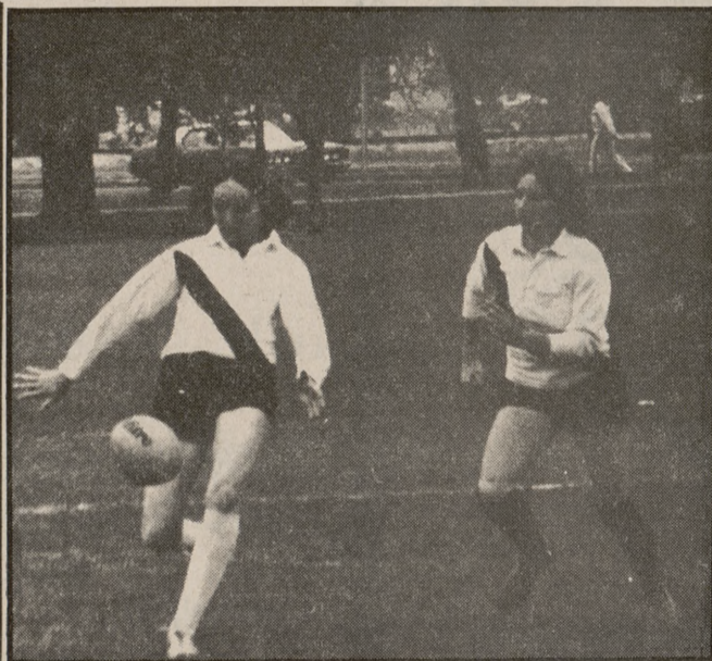
TAMU Women's Rugby Club finishes the Fall season 2nd in the Southern Conference!

The TAMU Weightlifters are gearing up for a much larger contest in the spring, since Texas A&M has been selected to host the National Powerlifting Championships. We look forward to supporting the club's efforts in April as we appreciate their cooperation this fall. THANKS AGAIN!