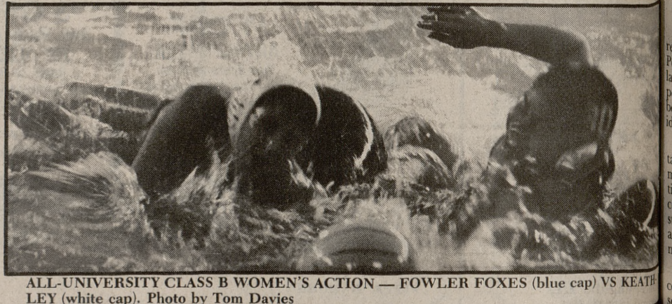
ALL-UNIVERSITY CLASS B WOMEN'S ACTION — FOWLER FOXES (blue cap) VS KEATHLEY (white cap).