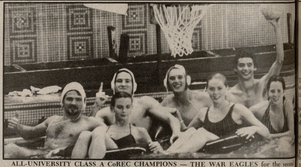
ALL-UNIVERSITY CLASS A CoREC CHAMPIONS — THE WAR EAGLES for the second straight year!