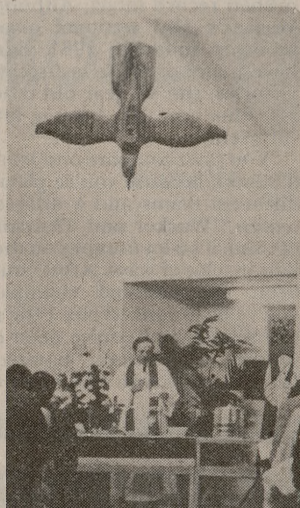
Stan Sultemeier 693-4403

1100 F.M. 2818 1st Fl. Grandd College Station, Texas 77840