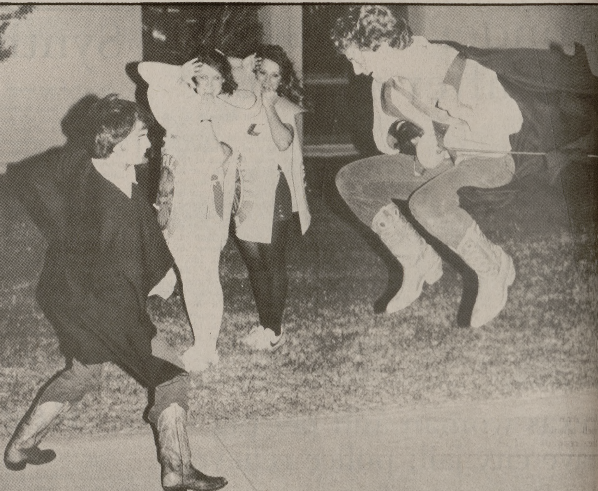
The beer worth fighting for

101 Jersey West (corner of Jersey & Wellborn across from Olsen field) THE STORAGE CENTER 696-4203 (Office at 512 West Loop) 36fn