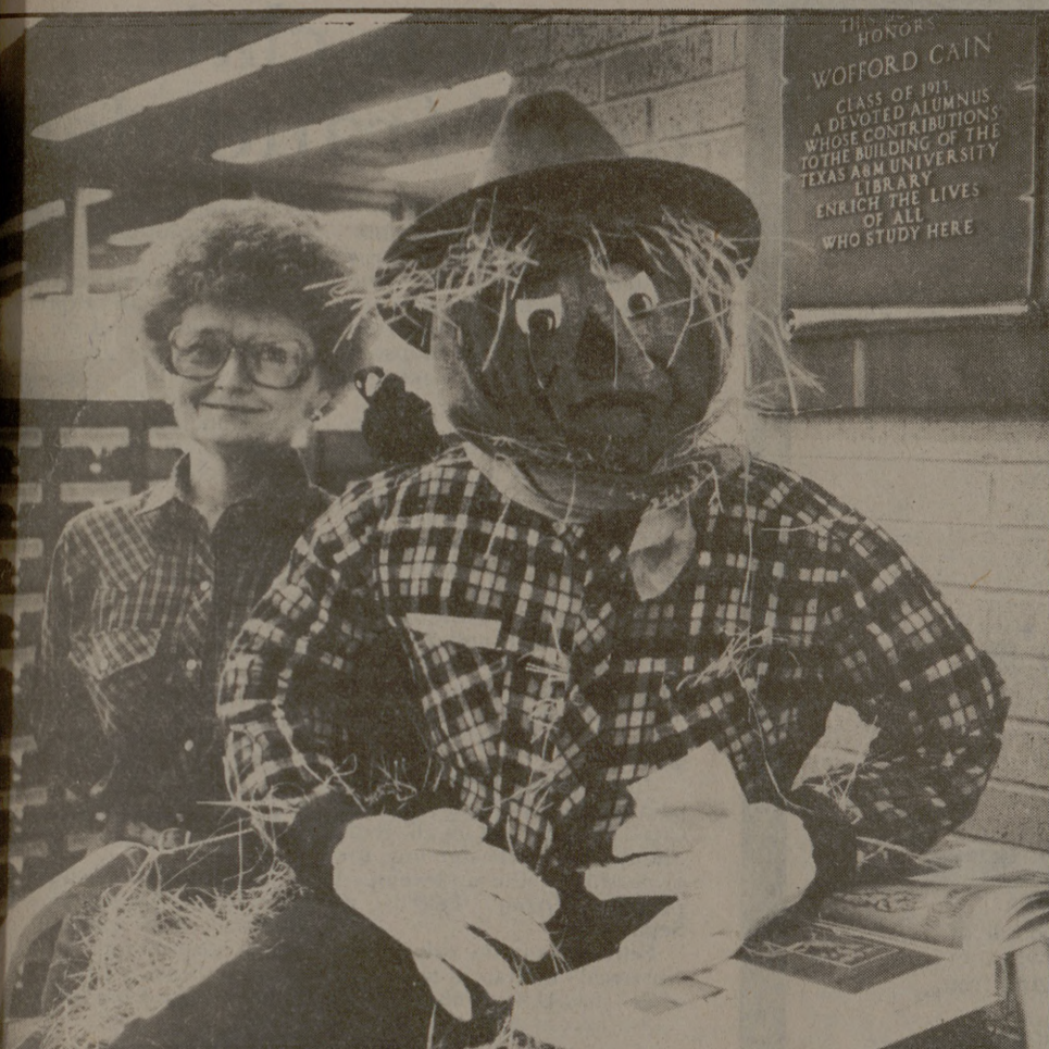
Which way to Oz?

at a Verona, Mo., chemical plant sprayed on roads for dust control in the early 1970s. The oil was