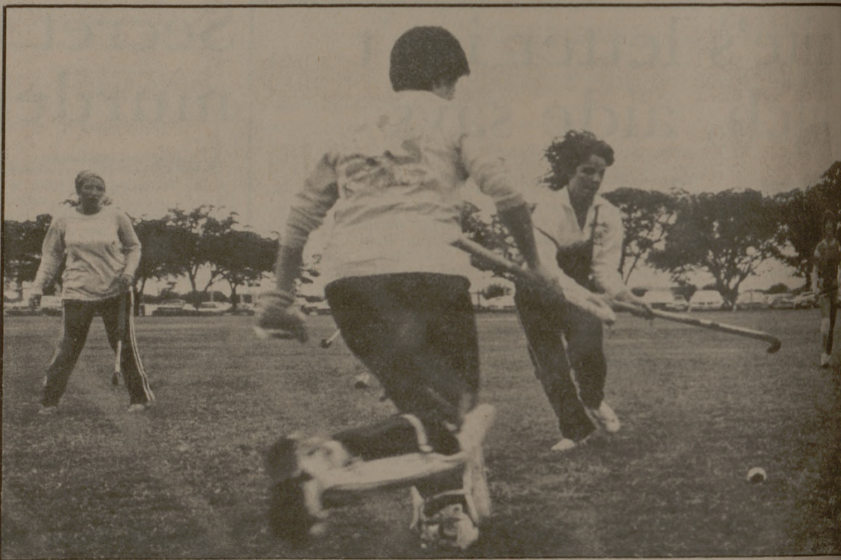
Hockey without ice

• Tens of thousands of Americans whose gas heat was disconnected last spring in states where winter disconnections are not allowed still owe utility bills of $300 to $500, offering little chance for reconnection before winter.