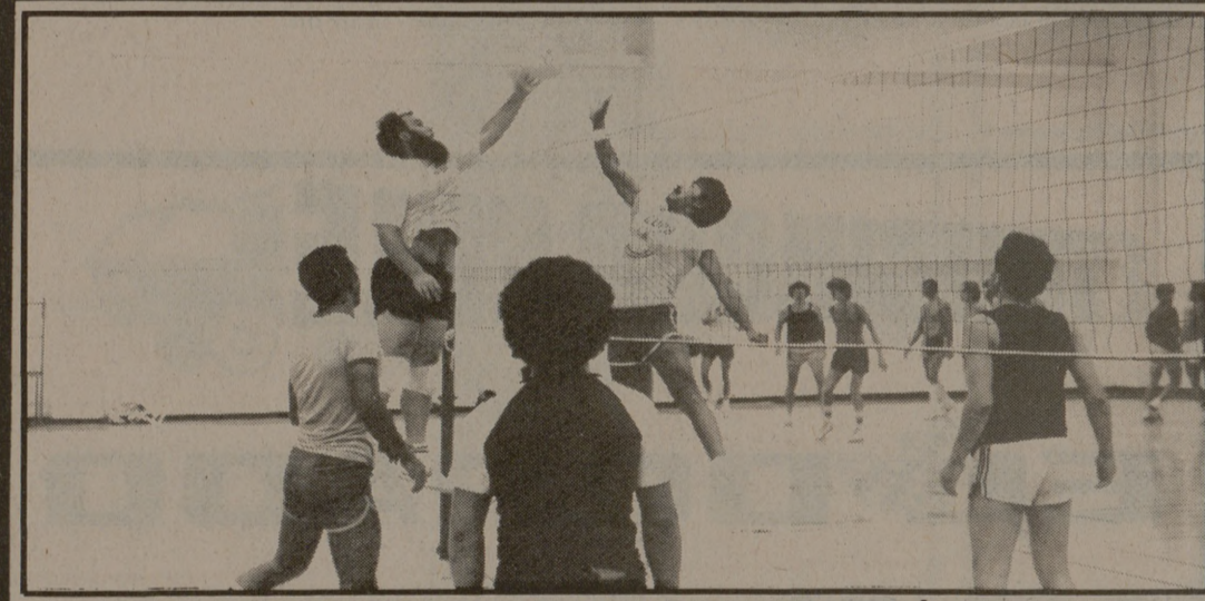
GET READY FOR VOLLEYBALL!