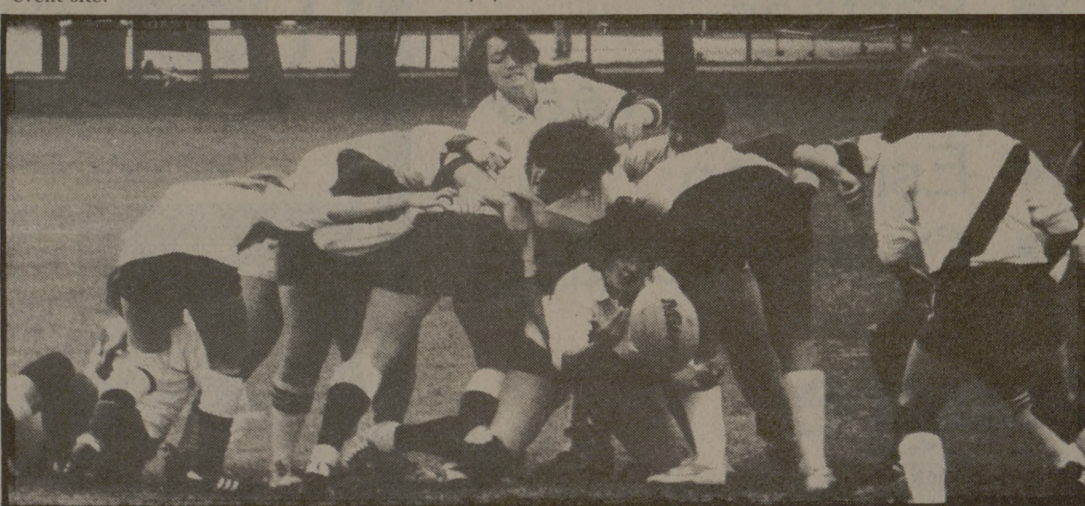
The TAMU Women's Rugby Team At Work

at the tournament site. A $2.00 green fee will be collected during registration at Pooh's Park. See you there!