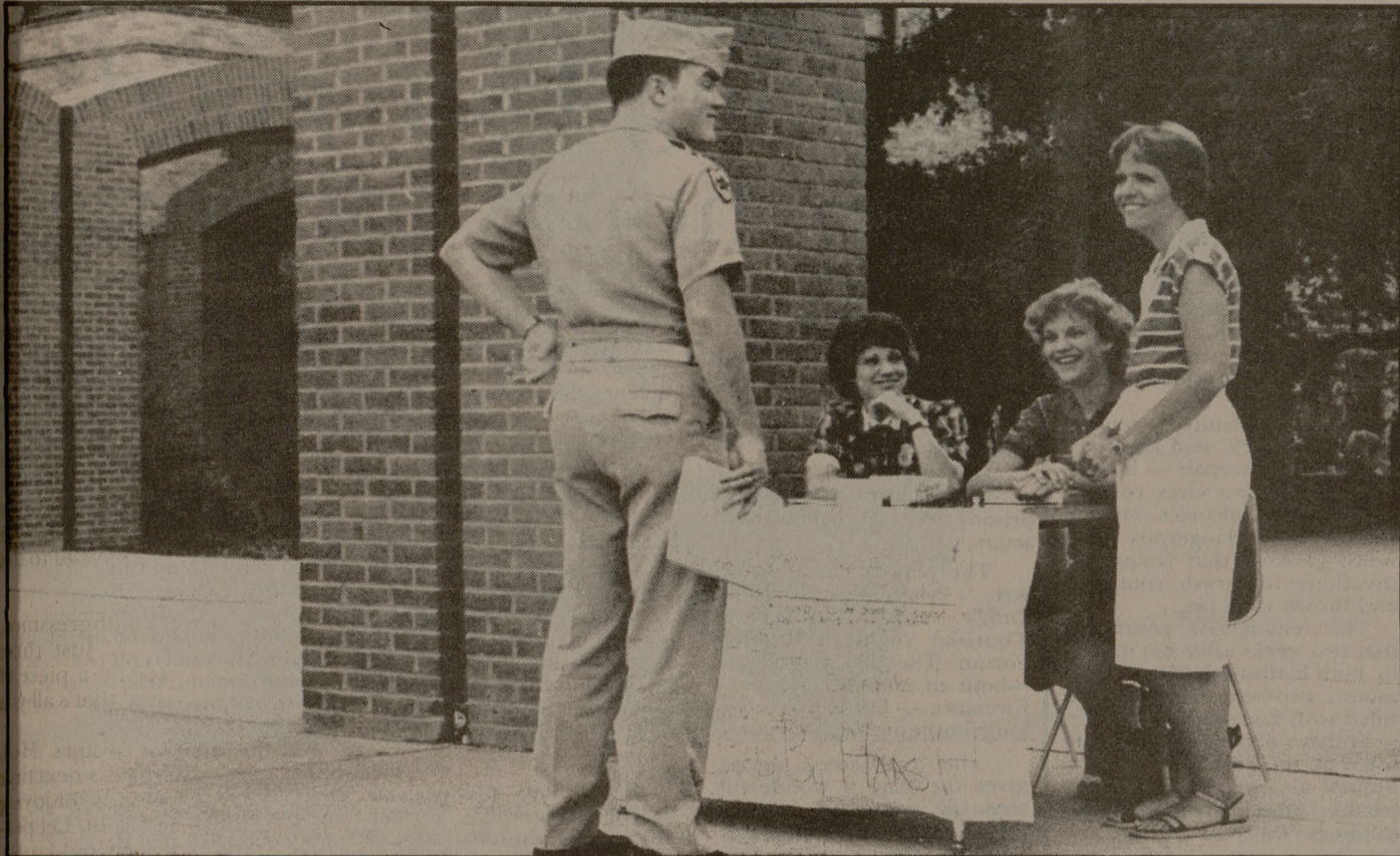
C'mon, buy one!