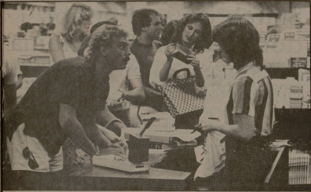
How much did you say?