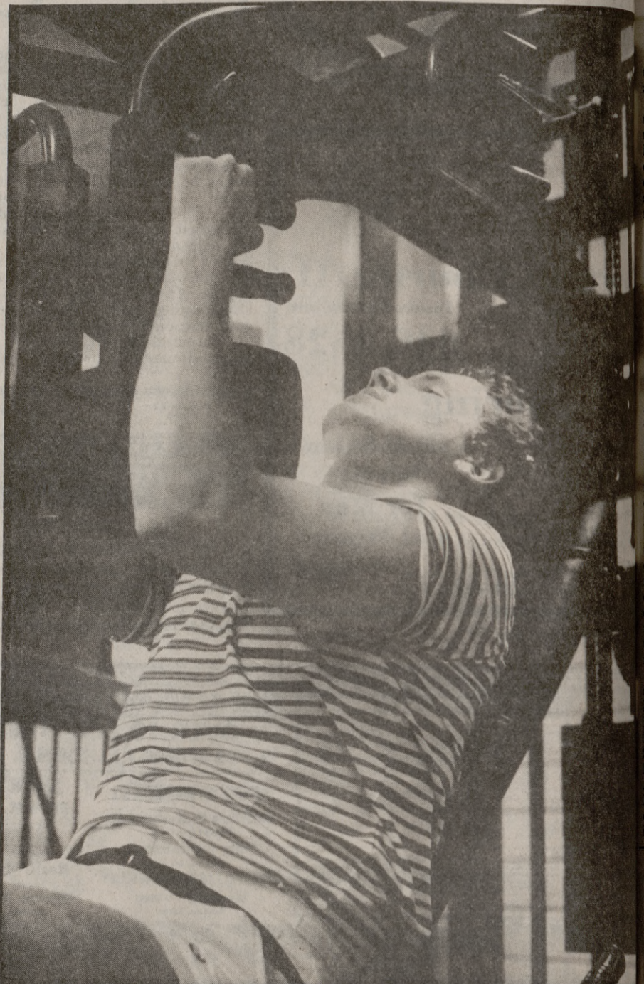
Weight room workout