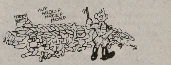
The Corps of Cadets gets its news from the Batt.

But that test was with men whose problem was deemed organic. Future research is still needed on impotent men whose problem is believed to be emotional.