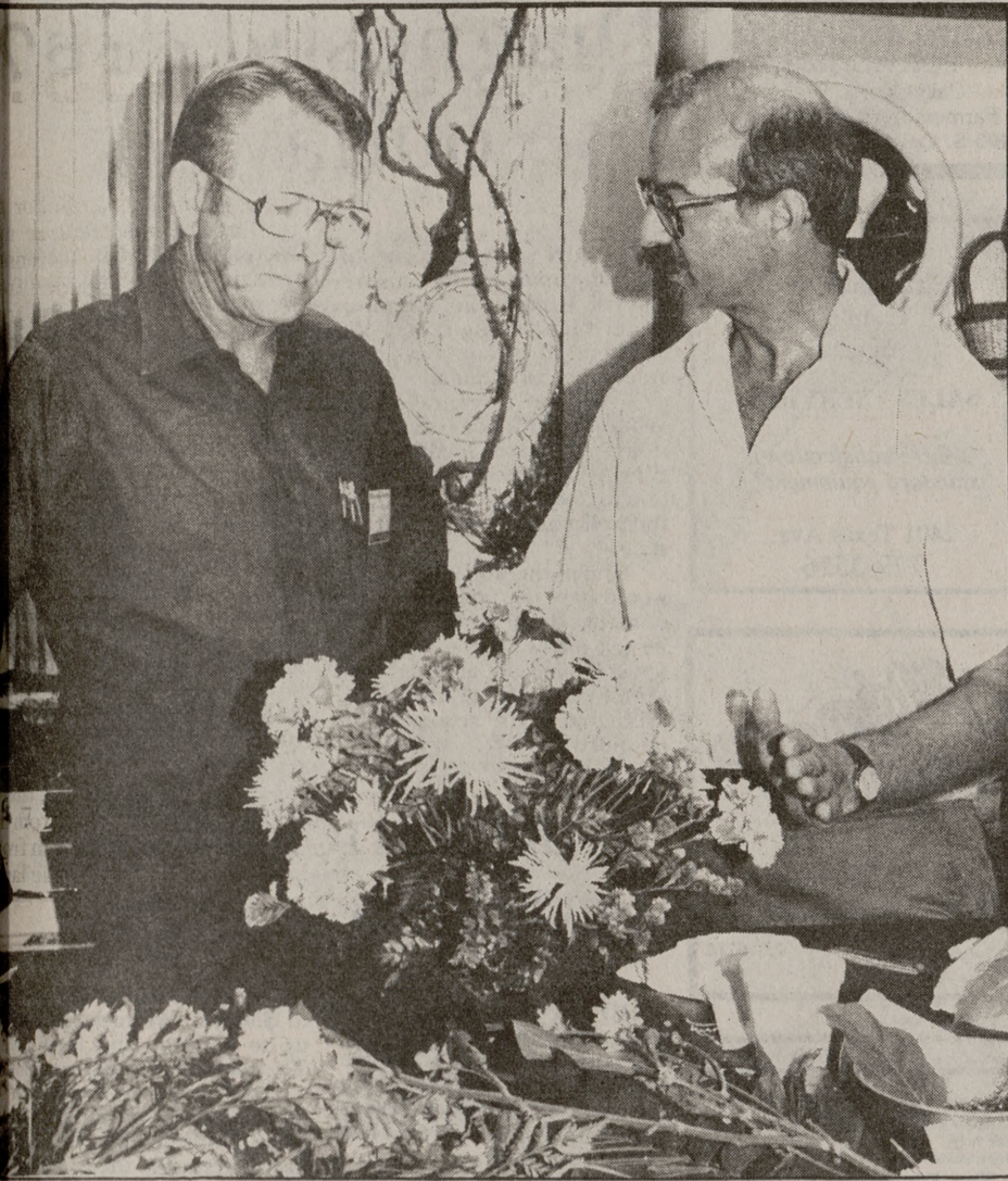
Saying it with flowers