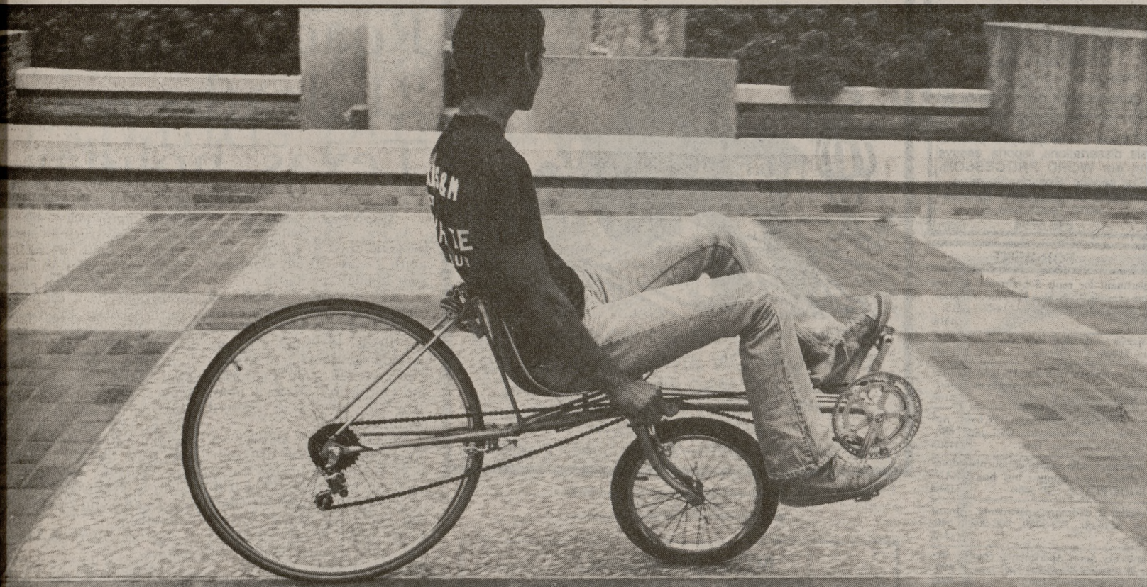
Move over, Schwinn!