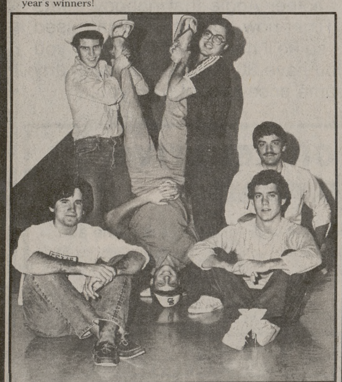
INNERTUBE WATER BASKETBALL — The Jebbies