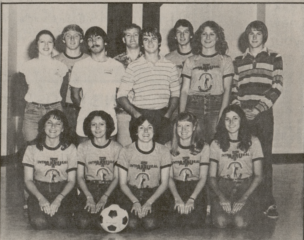
SOCCER — Cosmic Cats