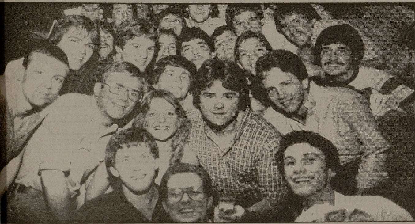
Anyone's best friend