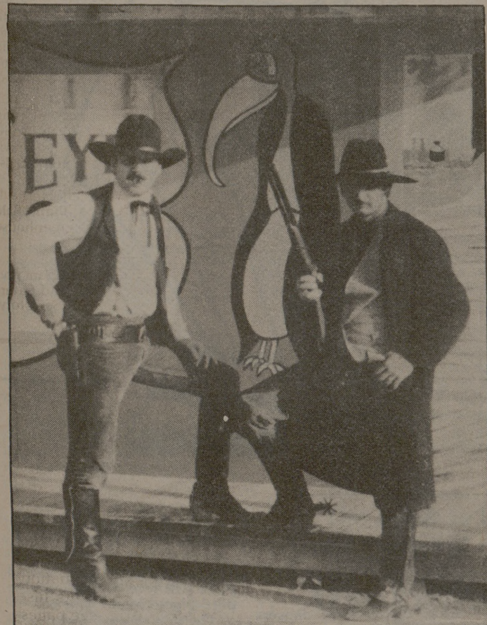
Gunfighters will be out to get each other at Houston's Frontier Days celebration.