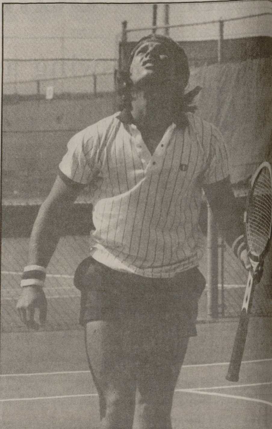
The Goodrich blimp?

"I couldn't sleep last night because of the error," he said. "It was on my mind a lot. It's an experience that I will grow from."