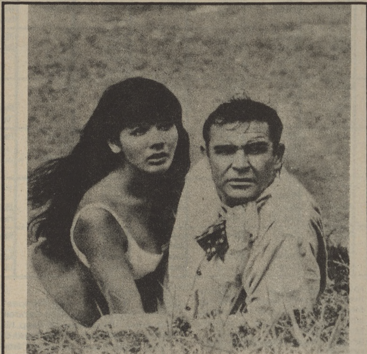
Sean Connery plays James Bond, who spies in the Orient and makes a female friend in the process, in "You Only Live Twice," which airs Monday on ABC.