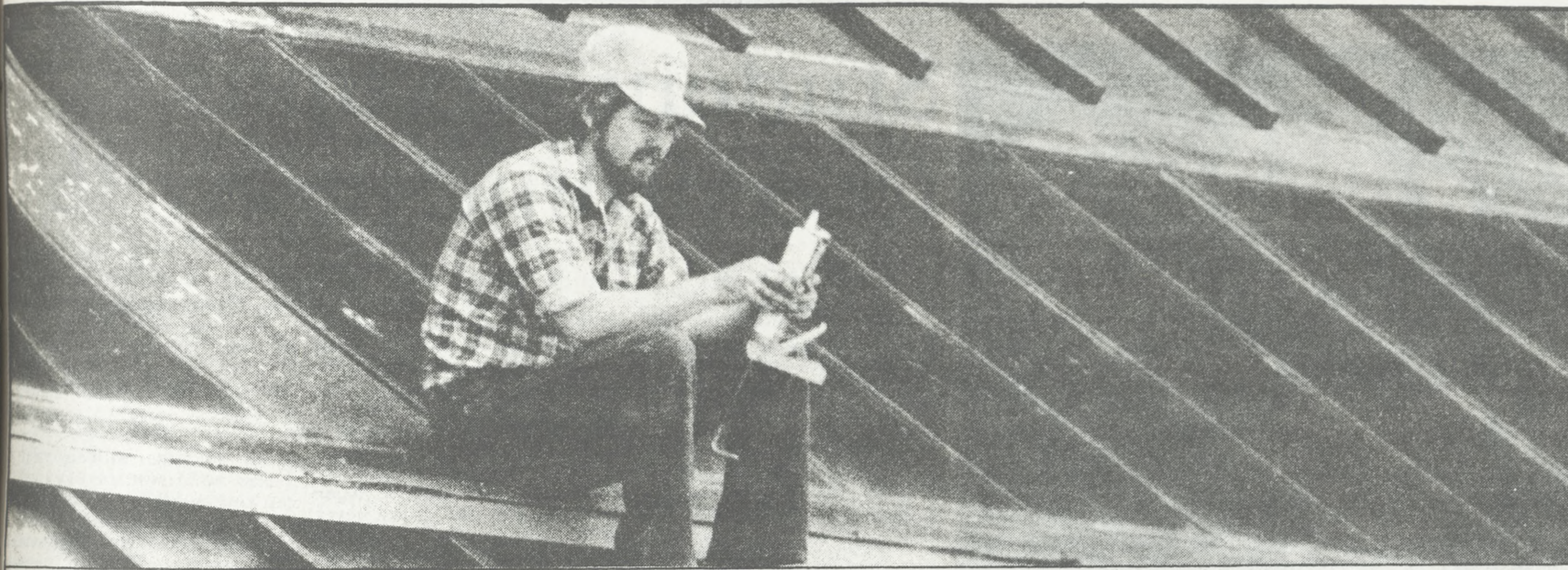
On top of things