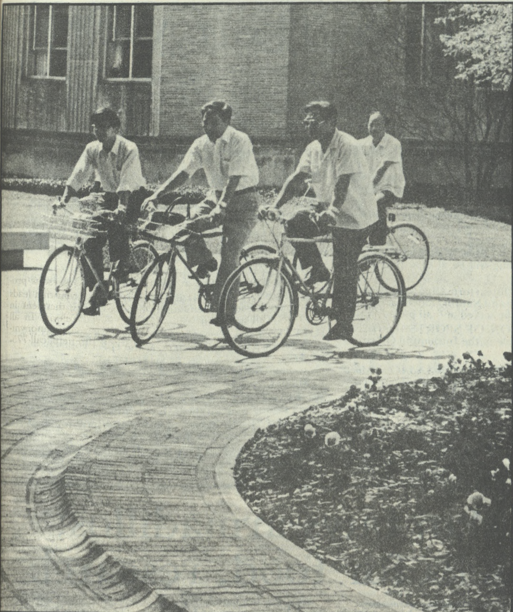
While you were gone