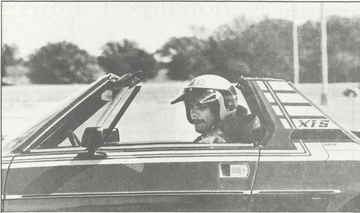
Moments before the race