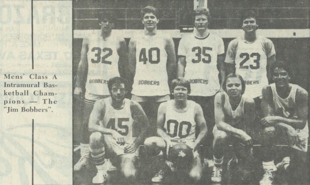
Mens' Class A Intramural Basketball Champions — The "Jim Bobbers".

IM Game Plan VOLLEYBALL ENTRIES OPEN: Today is the first day to sign up your team for this year's Volleyball Triples Tournament. Entries will be taken in the IM office through Tuesday, March 23, and play will begin March 29. The entry fee is $10.00 per team. There will be a men's, women's, and core division in Classes A, B, and C. OFFICIALS MEETING: Men and women interested in officiating Volleyball Triples should attend the meeting tonight at 7 p.m. in room 162 East Kyle. ENTRIES CLOSE: Tomorrow, March 9, is the last day to sign up in the IM office for Innertube Water Polo, Water Polo, Badminton Doubles, and the Slam Dunk Contest. Three competitive options are offered in each sport for men and women. EXTRAMURAL SPORTS CLUB MEETING: On Tuesday, March 9, each sport club must send one representative to the bi-monthly meeting at 6:30 p.m. in room 162 East Kyle. SLAM DUNK CONTEST: Wednesday night, March 10 at 7 p.m., the main floor of G. Rollie White will be the scene of the 1982 slam dunk contest. Interested men and women can enter the competition in the IM office or at the contest. A $1 entry fee will be assessed each person, and male and female champions will be awarded Intramural T-shirts. TEAM CAPTAINS MEETING: Innertube Water Polo and Water Polo team captains meet Thursday, March 11 at 5:15 p.m. in Room 167 G. Rollie White to pick up schedules and go over rules.