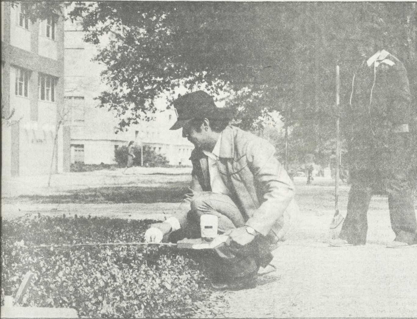
There's got to be an easier way