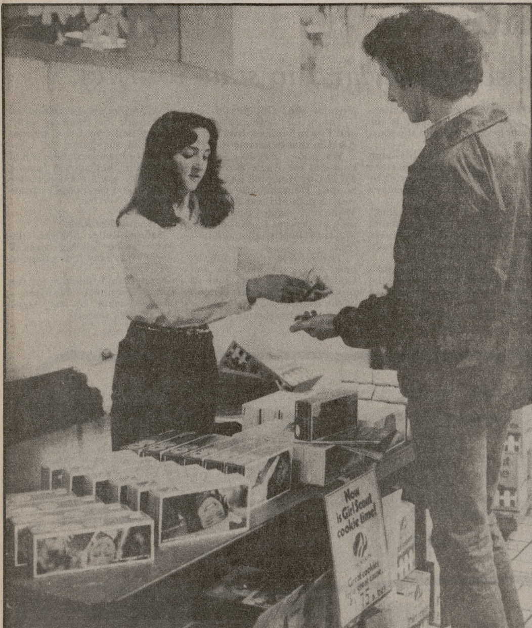
Girl Scout Cookies for sale