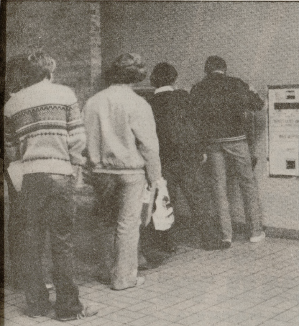
One more line