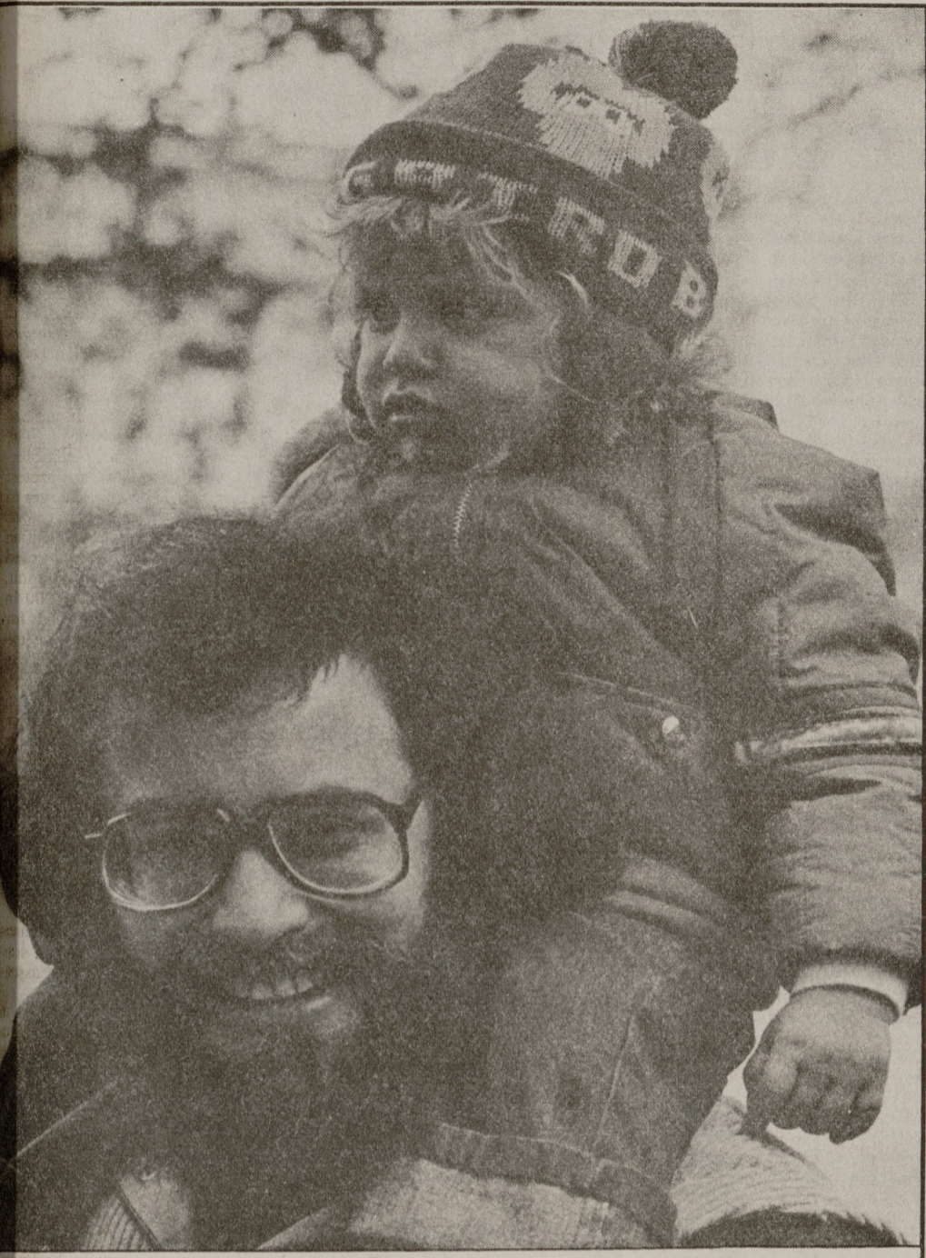
Bird's eye view