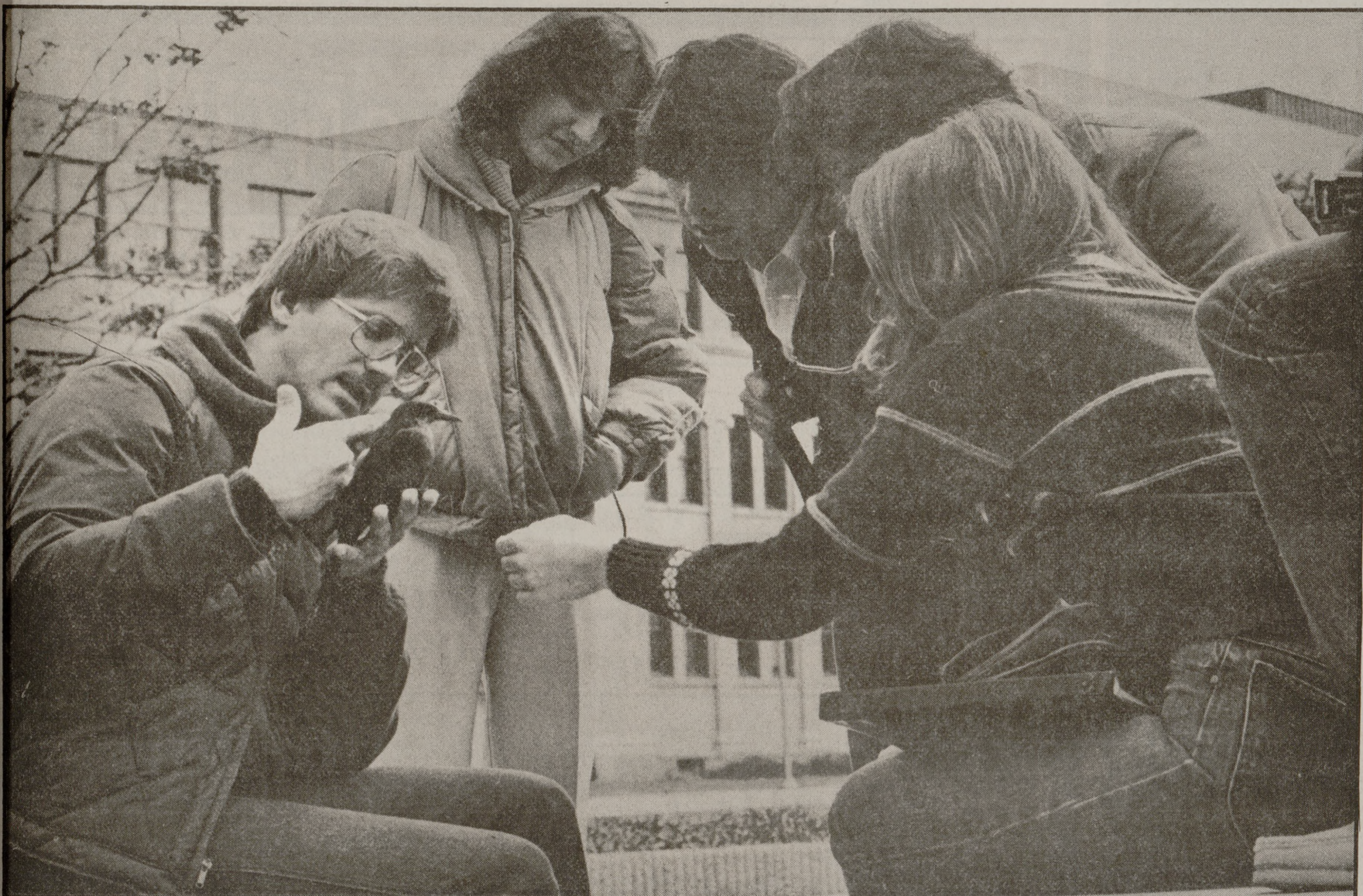
Lending a helping hand