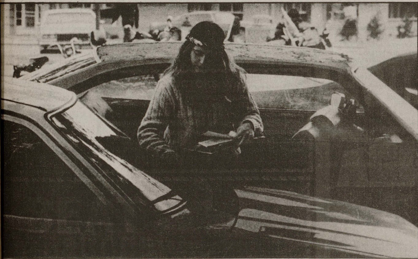
That's a no-no