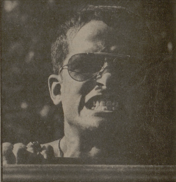
CHIN UP... Finals are almost over!

and Happy Holidays from the Intramural-Recreational Sports Staff!