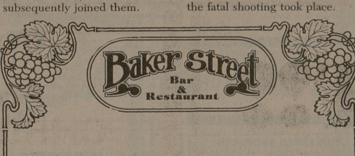
PLATE LUNCH SPECIALS

she drove a getaway car from the scene of the robbery at the Crocker National Bank branch where the fatal shooting took place