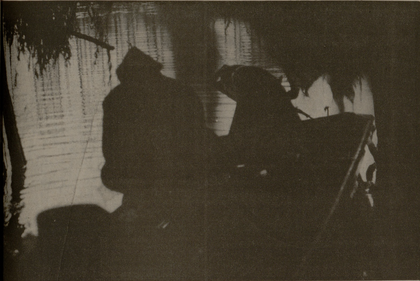
Dawn's early light