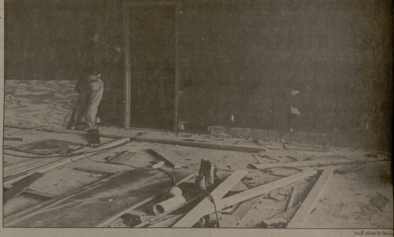
pavilion in College Station. Upon its completion in

A worker continues construction on an open-air barbecue December, the facility will be able to accomodate at least people.