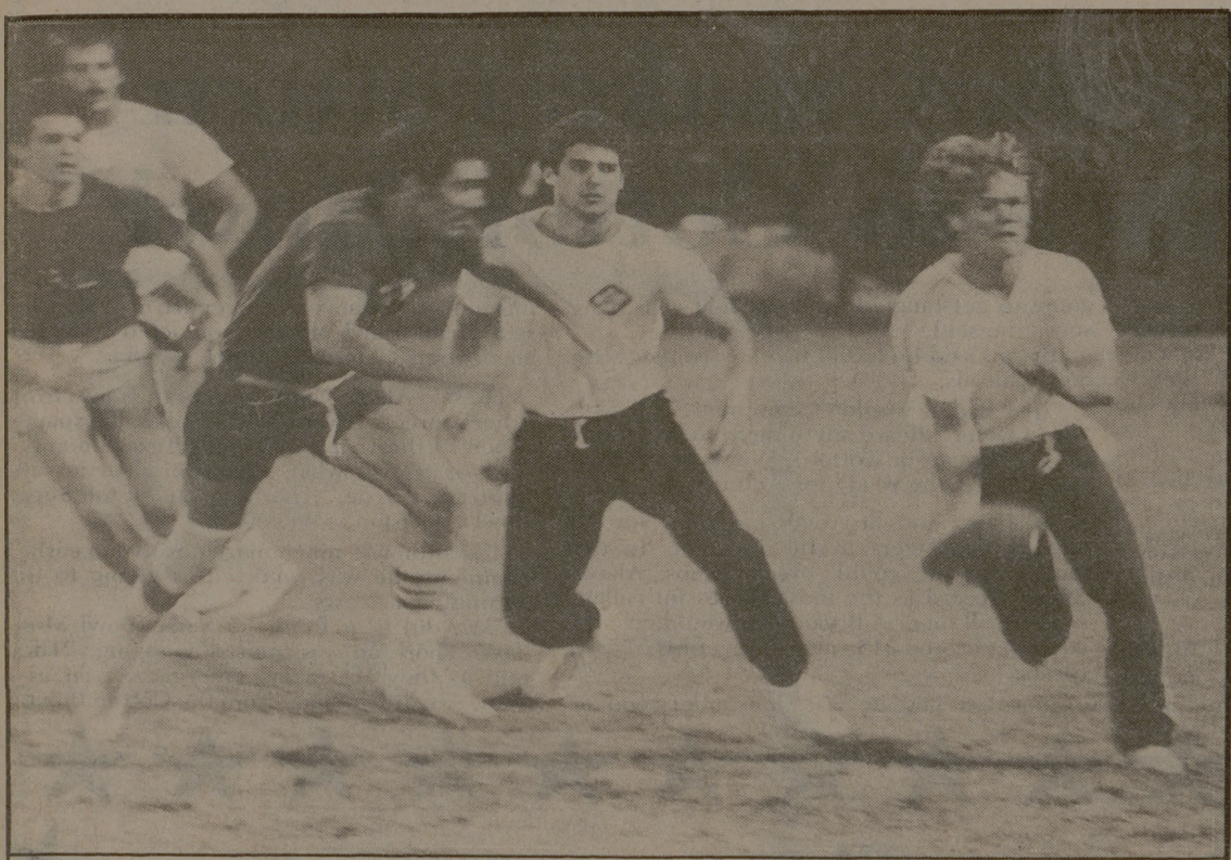
Reading the defense