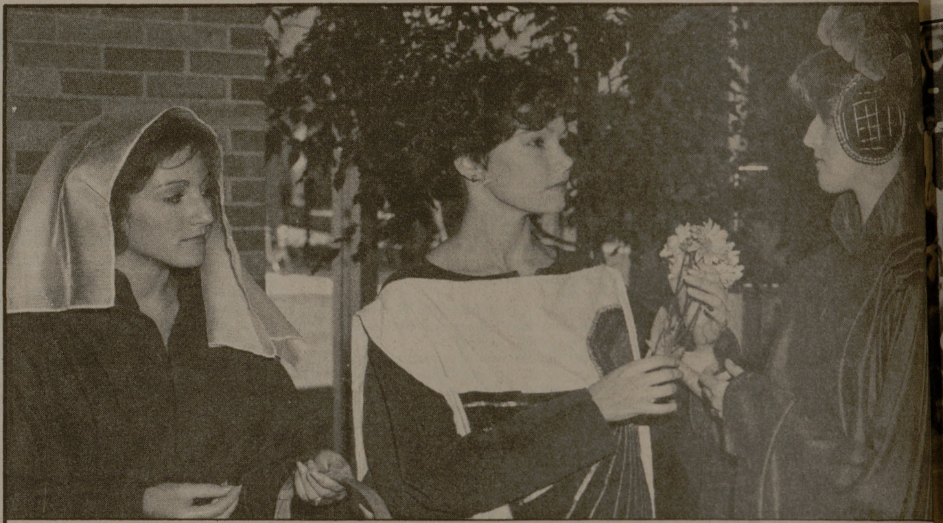
Ladies in Waiting