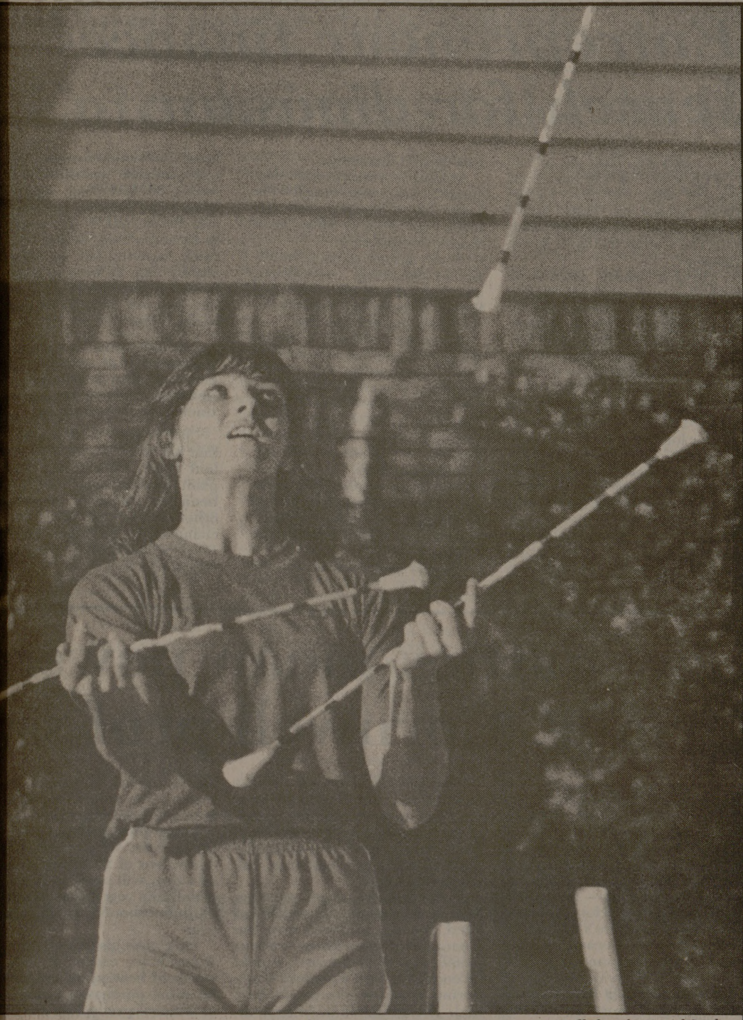
A juggling act