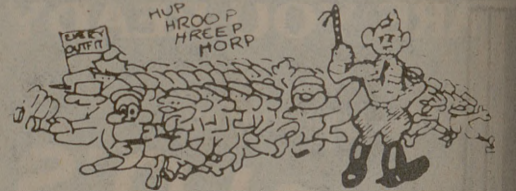
The Corps of Cadets gets its news from the Batt.

In other birthday festivities, Corps will also have the Service Ball to commemorate birthdays of both the Marine Corps and the United States Navy.